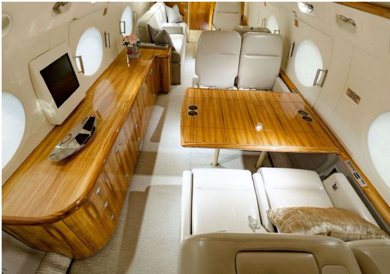
2009 Gulfstream G550